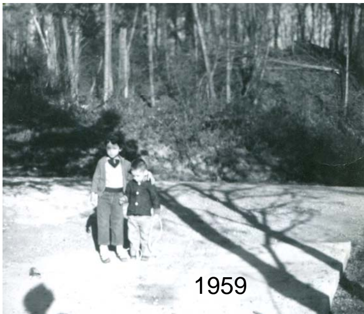
111 th looking east