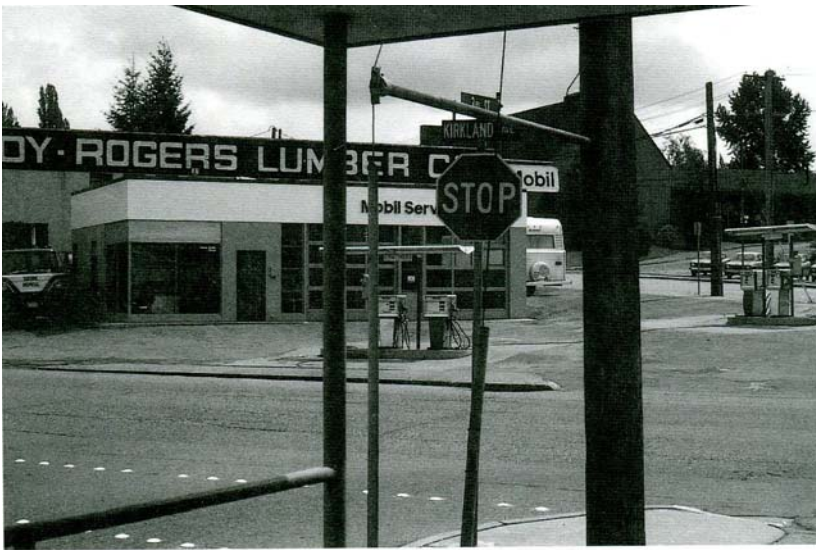
McEvoy-Rogers Lumberyard and Johnnie's Mobil Station, corner of State Street and Kirkland Avenue, 1975.