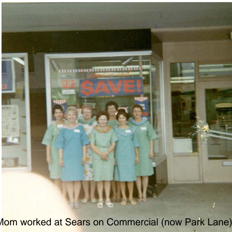
Mom worked at Sears on Commercial (now Park Lane)