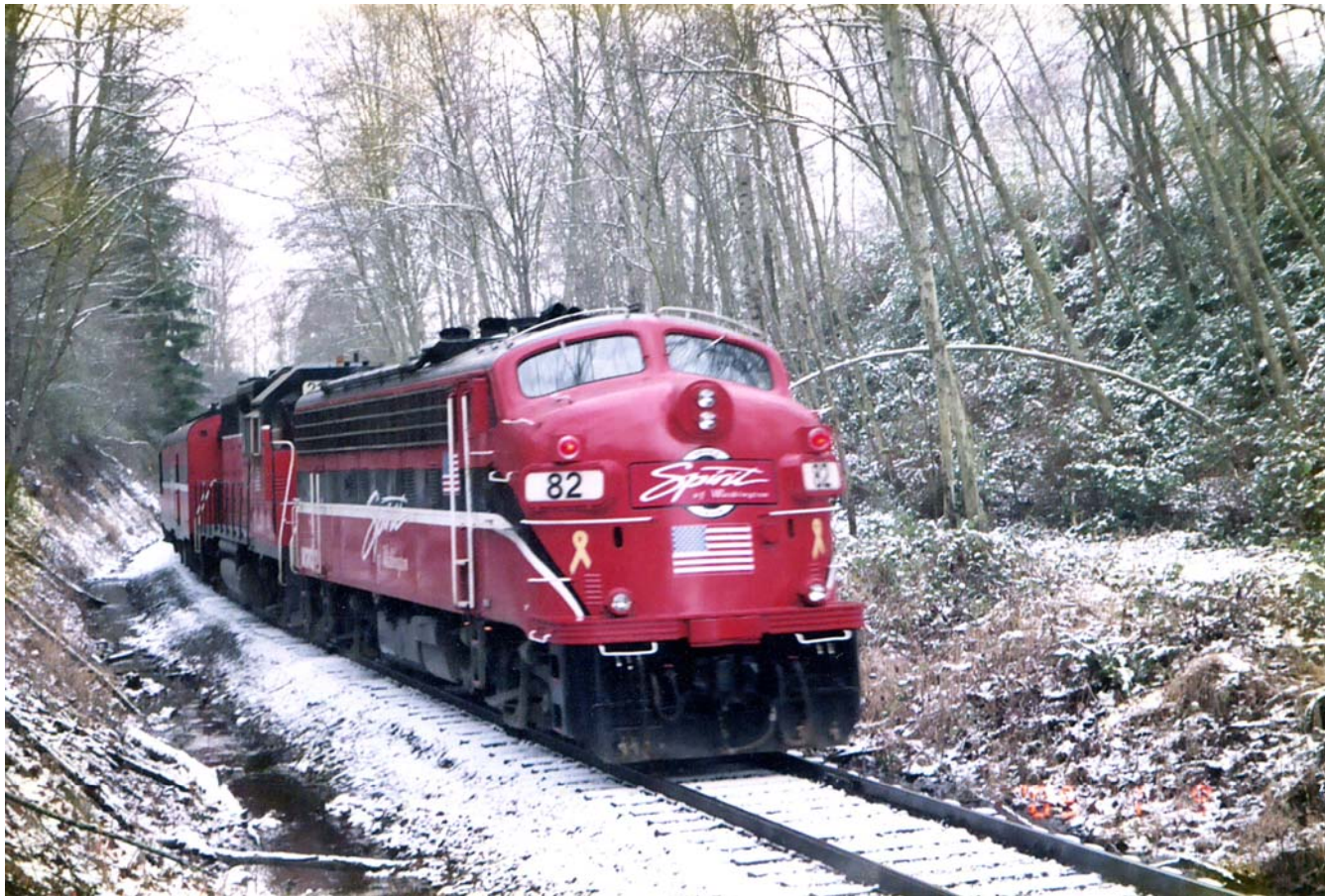
Spirit of Washington Dinner Train ran behind Rychlik property Stopped running in 2007 (Kids used to race the train with horses)