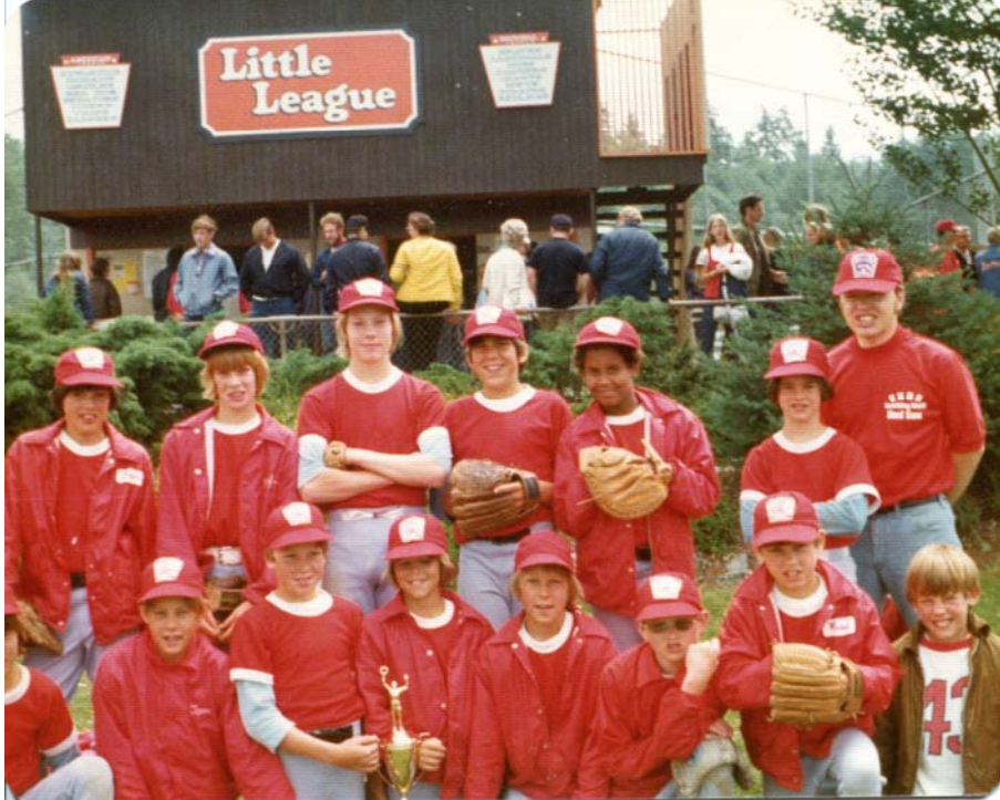
Everest Ball Field