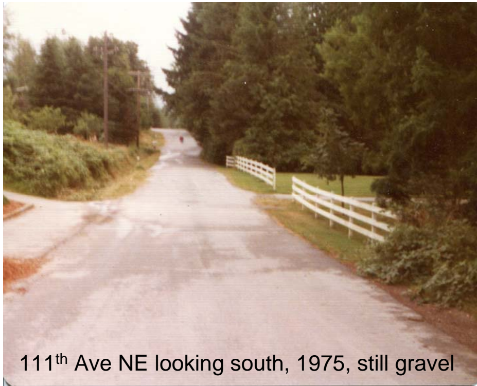
111 th Ave NE looking south, 1975, still gravel