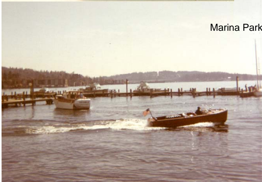
Marina Park, 1971; the first pavilion