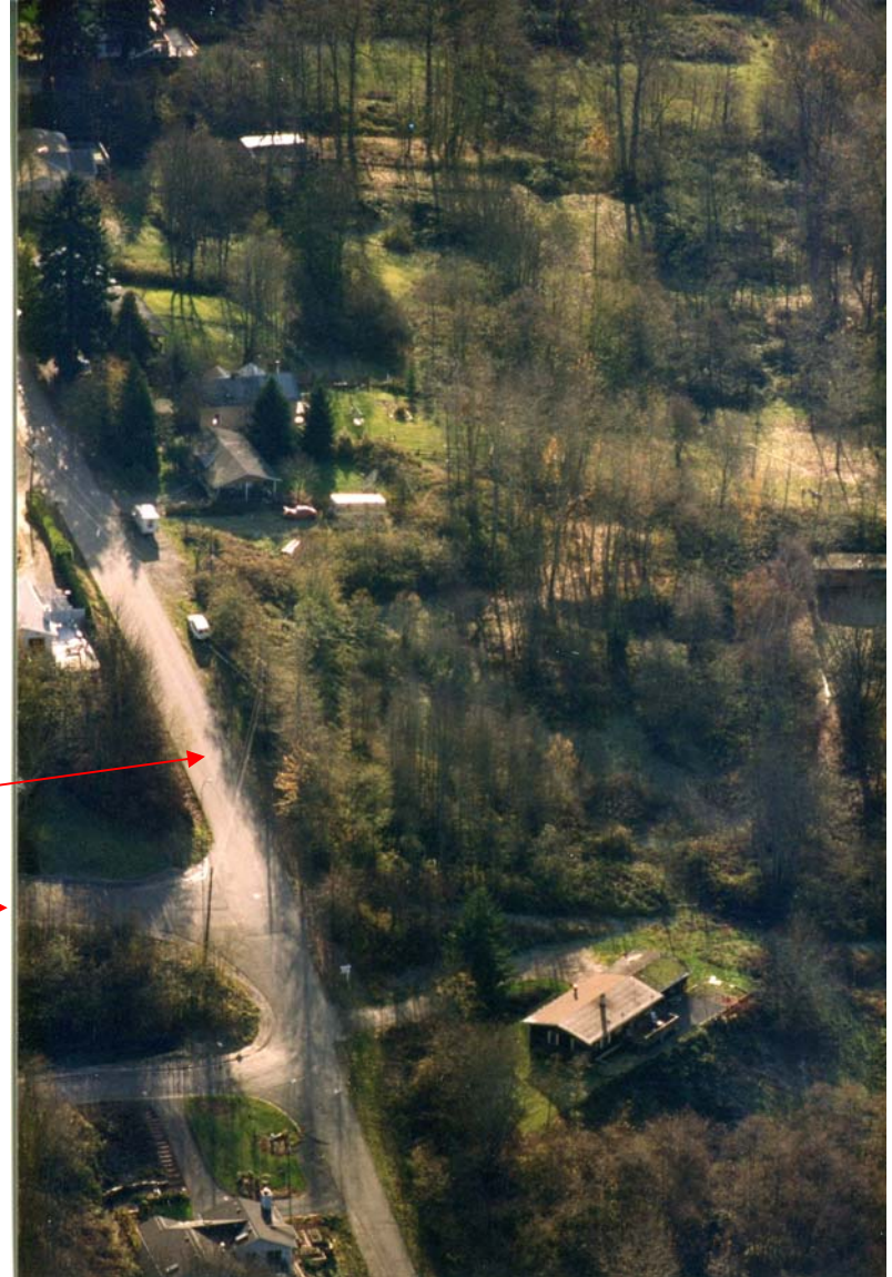
Aerial photos from early 90s